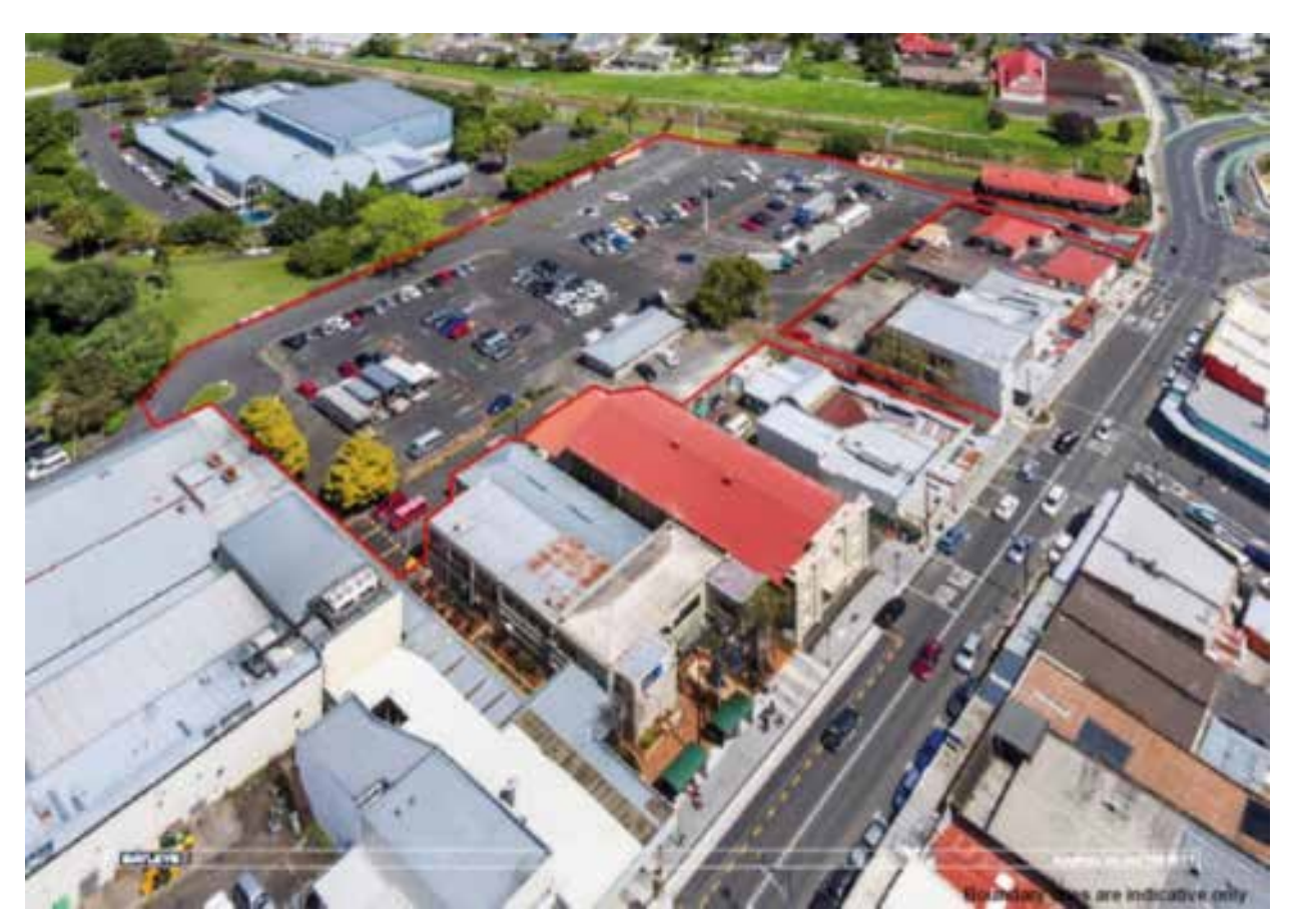
Figure 7: Tavern Lane development site

A high level of environmental quality is expected. The site is an opportunity for Panuku and our development partner to achieve an exemplar project that shows how a high-quality, sustainable building can be constructed in a suburban town centre.