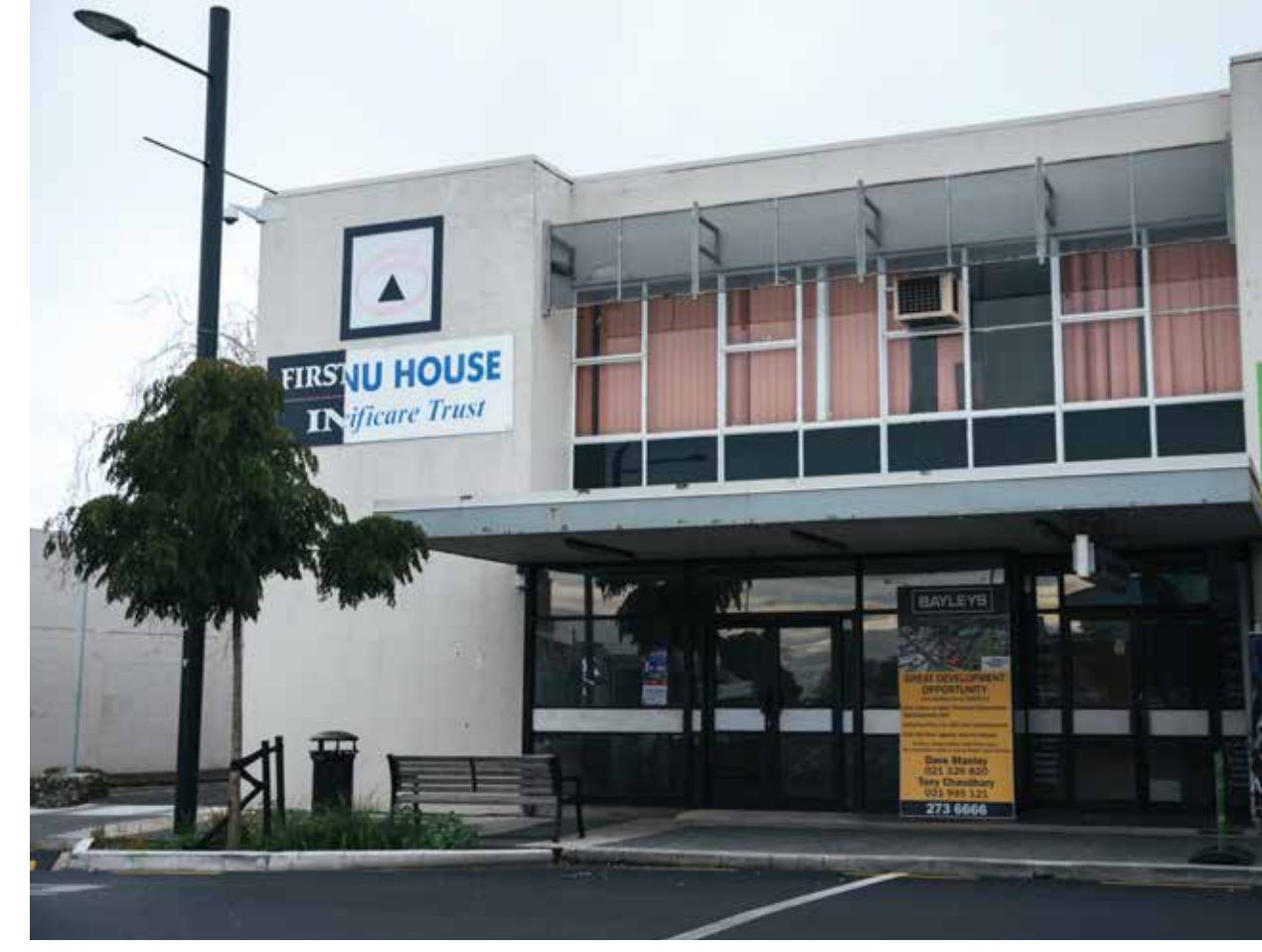
Figure 6: Street view 17 St George Street