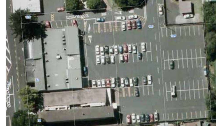
Figure 9: Aerial showing the car park at 107 and 109 St George Street