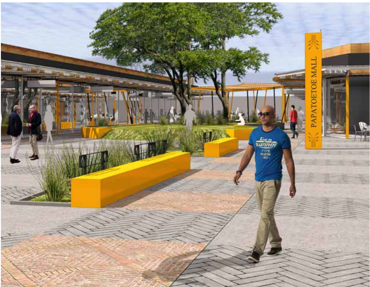
Figure 4: An artist's impression of Old Papatoetoe Mall