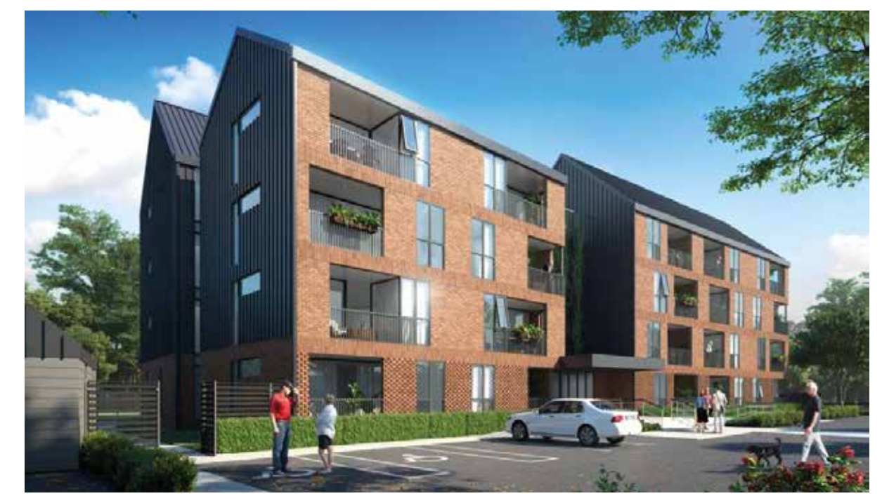
Figure 8: 33 Henderson Valley Road preliminary design (Ignite Architects)

Subject to the satisfactory resolution of these matters, Auckland Council has agreed to dispose of, or transfer the site. A potential form of development could be similar to that envisaged for 33 Henderson Valley Road development shown below.