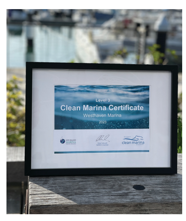
NZMOA's Clean Marina Certificate