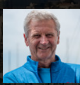
Head of Marinas Eke Panuku Development Auckland